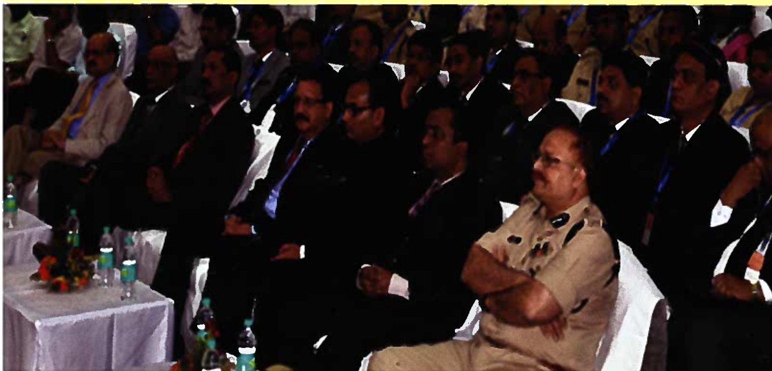
First State level conference on Criminal Justice-Fair Investigation & Fair Trial held on 12/09/2015 at Raipur.