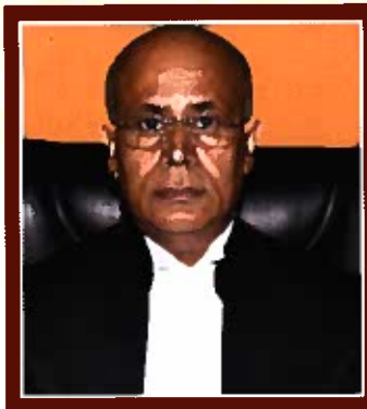
Hon'ble Shri Justice Navin Sinha The Chief Justice & Patron-in-Chief, CSJA