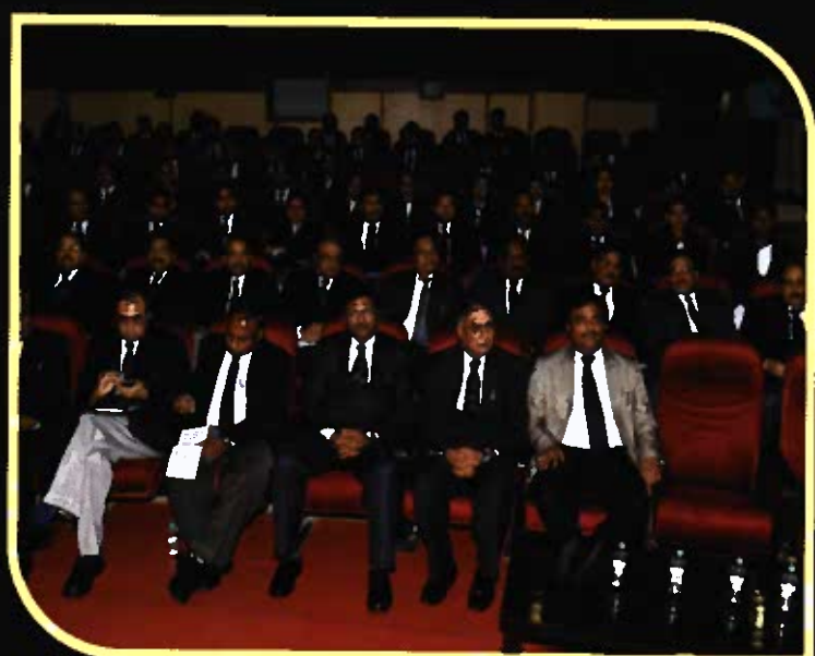
Review of Progress in Computerization of District Courts with Emphasis on Delivery of Citizen Centric Services - 16.05.2015